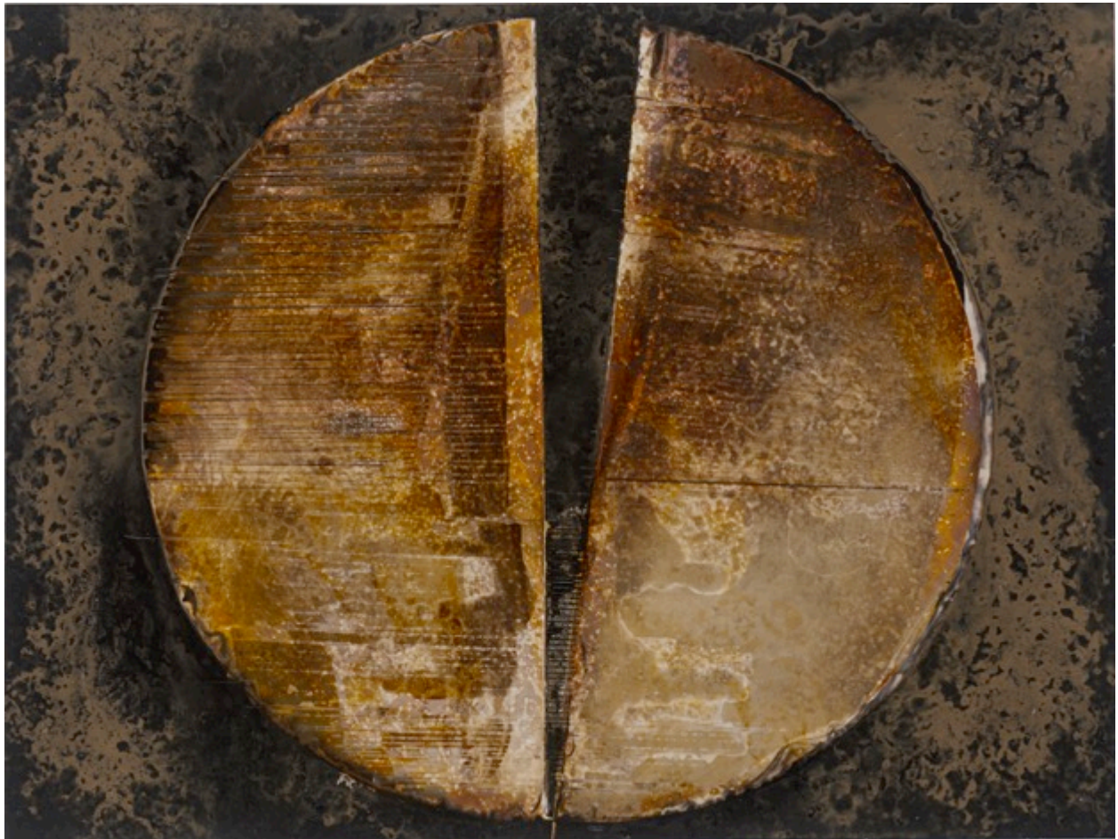
Cercle brisé 3, 2015