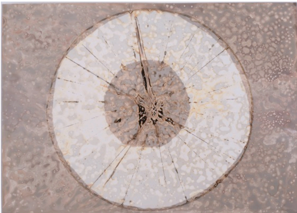
Untitled #3 , 2014